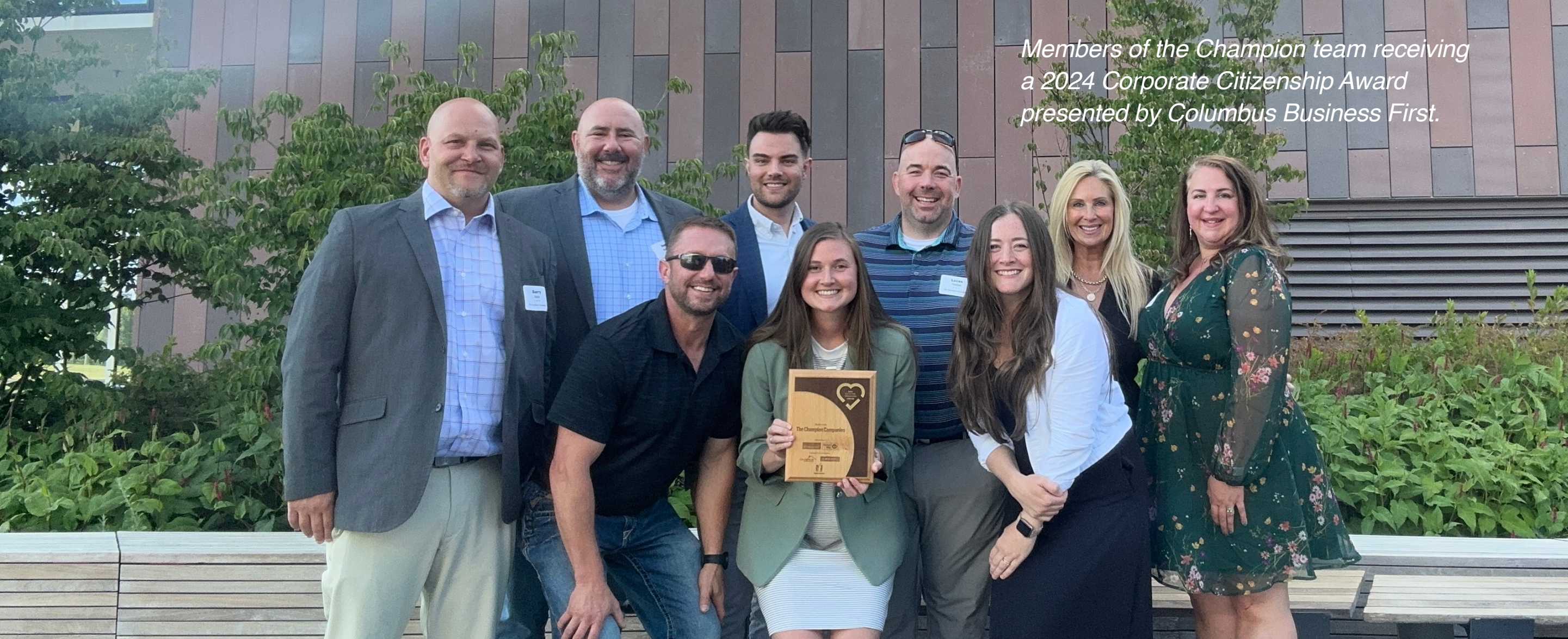
Members of the Champion team receiving a 2024 Corporate Citizenship Award presented by Columbus Business First.